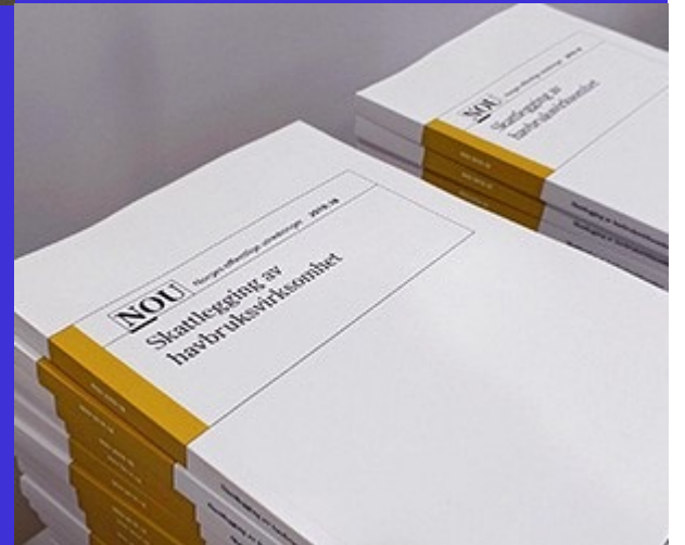
Official Norwegian Reports (NOUs)